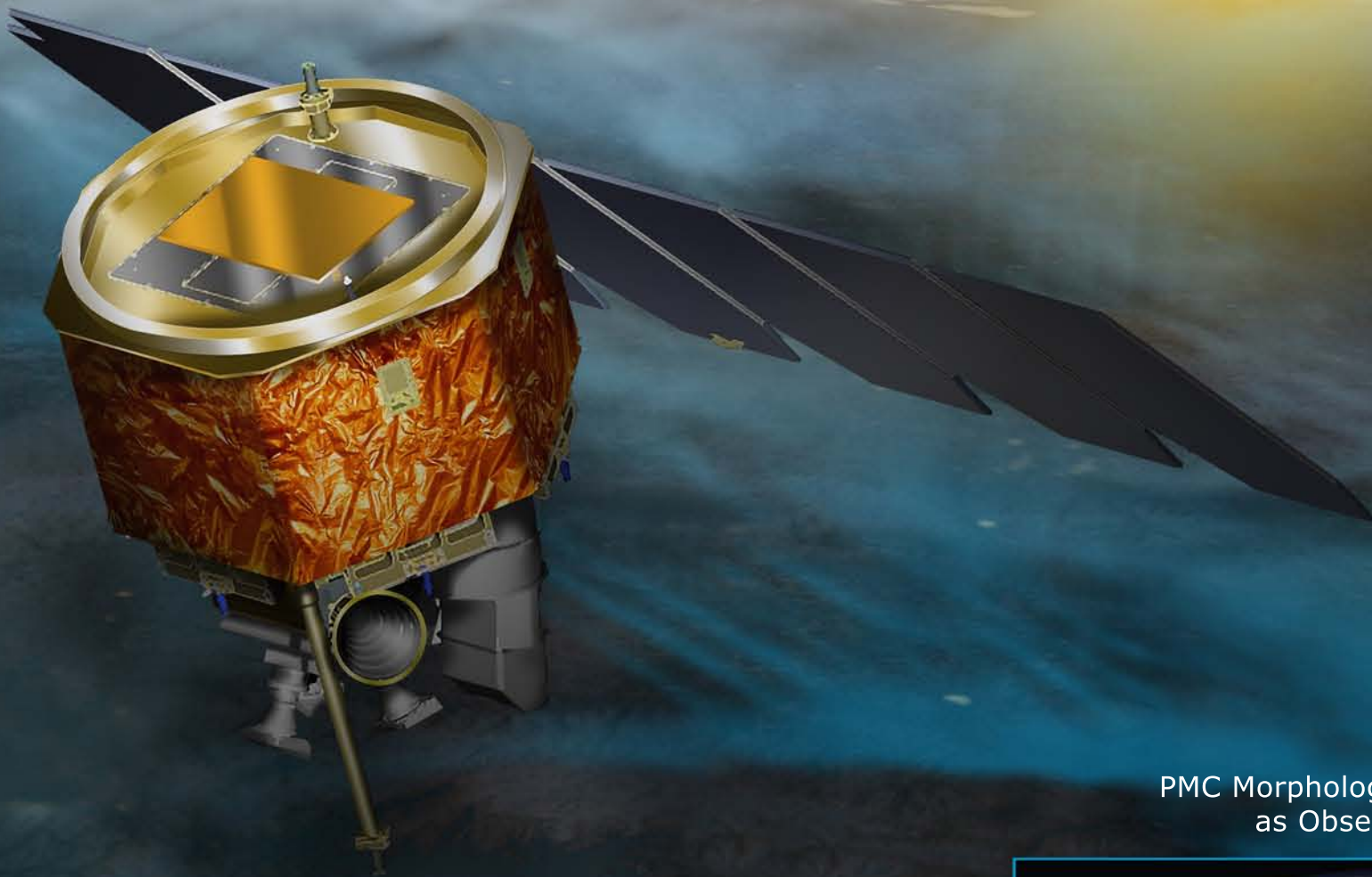
PMC Morphology on July 15, 2007 as Observed by CIPS